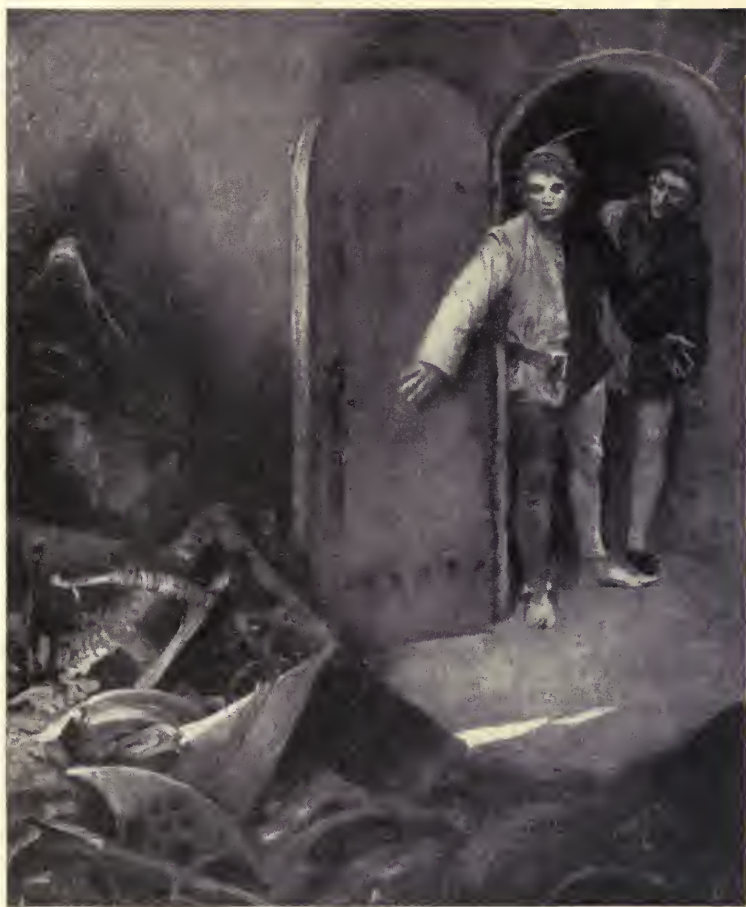
"Myles pushed the door farther open"